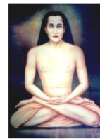
Kriya Babaji Nagaraj