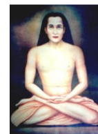
Kriya Babaji Nagaraj